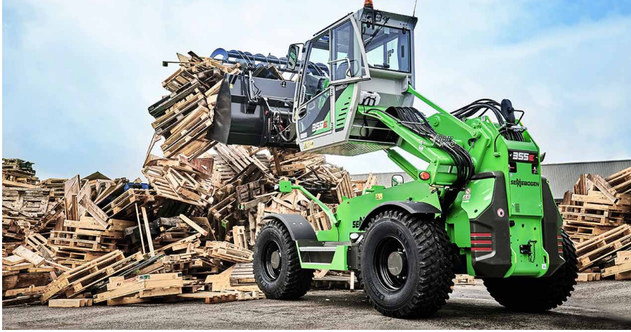
Air LGV90/C1 fitted to Sennebogen's new 355 E telehandler